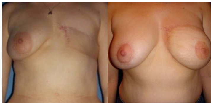
42 year-old patient 5'3" and 140lbs. This patient underwent delayed left breast reconstruction using a deep inferior epigastric perforator (DIEP) flap, nipple reconstruction and tattoo. She also required a right mastopexy. The post-operative photo is one year post-reconstruction.